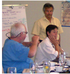
Southwest Rural Policy Network members work together to create a policy statement about Arizona Senate Bill 1070.

To date, the Network's accomplishments include establishing vision and mission statements, developing a decision-making process, hiring a network coordinator, creating policy-interest action teams, and creating a regular meeting schedule. The SWRPN is now transitioning into a more outward focused stage, seeking to affect policy for the benefit of rural people and rural communities.